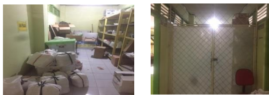
Gambar 1. Practical Material Logistics Warehouse