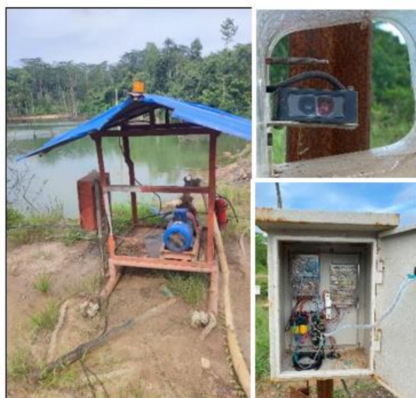
Figure 2. Waterfill Condition