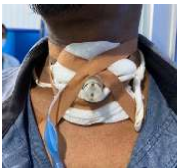
Figure 4. After installing the Tracheostomy Cannula

The initial treatment is to perform an emergency tracheostomy for the patient to treat grade III upper airway obstruction caused by the tumor. However, when preparing for a tracheostomy, X-rays and laboratory results and given corticosteroids, the OSNA level of the patient decreased to stage II, which in the management of this case was not included in an emergency. It is enough to do an elective tracheostomy. Finally, the patient underwent a tracheostomy on 2 February 2023 and extirpation of the mass and microlaryngeal biopsy were performed.