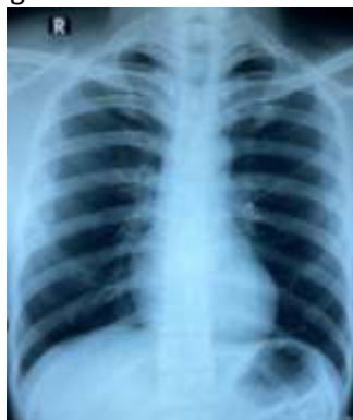
Figure 3. Thorax X-ray photo

On the results of anatomic pathology examination, the results of well-differentiated keratinized squamous cell carcinoma were found. The CT scan results showed a right supraglottic mass accompanied by dextra deep cervical lymphadenopathy with T2N1M0 stage. The results of a chest X-ray found pumo and cast within normal limits so that it can be concluded that there are no metastases to the lungs or mediastinum. The patient was diagnosed with laryngeal carcinoma. The management of this patient is to perform a total laryngectomy so that he needs to be referred to another hospital that provides more adequate facilities.