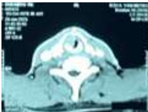
Figure 2. Axial Section CT Scan Results